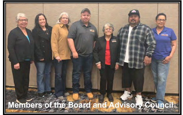
Members of the Board and Advisory Council